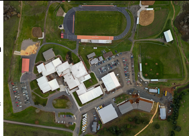
We transitioned from having three separate campuses to one unified K-12 campus in 2009.

Our staff consists of four licensed administrators (Principal and VP at the elementary level, one middle school principal and one high school principal). Additionally, we have 59 licensed teachers and 50 classified employees. Our adopted budget for the 2023-24 school year was $21,780,717.