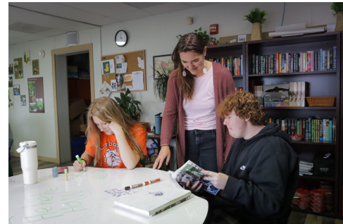
We offer chinuk wawa language classes at the HS level