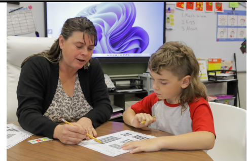
Approximately 22% our staff are former alumni of WSD

There are many locally owned businesses that are there to tend to your needs. If you're visiting, you can book a room at the Wildwood Hotel. Grab a bite to eat at Coyote Joe's, Dillon's Bar & Grill, or Oddfellows Pizza, or enjoy coffee and a treat from Slow Train Coffee. There are many more options to visit in our ever-expanding downtown area.