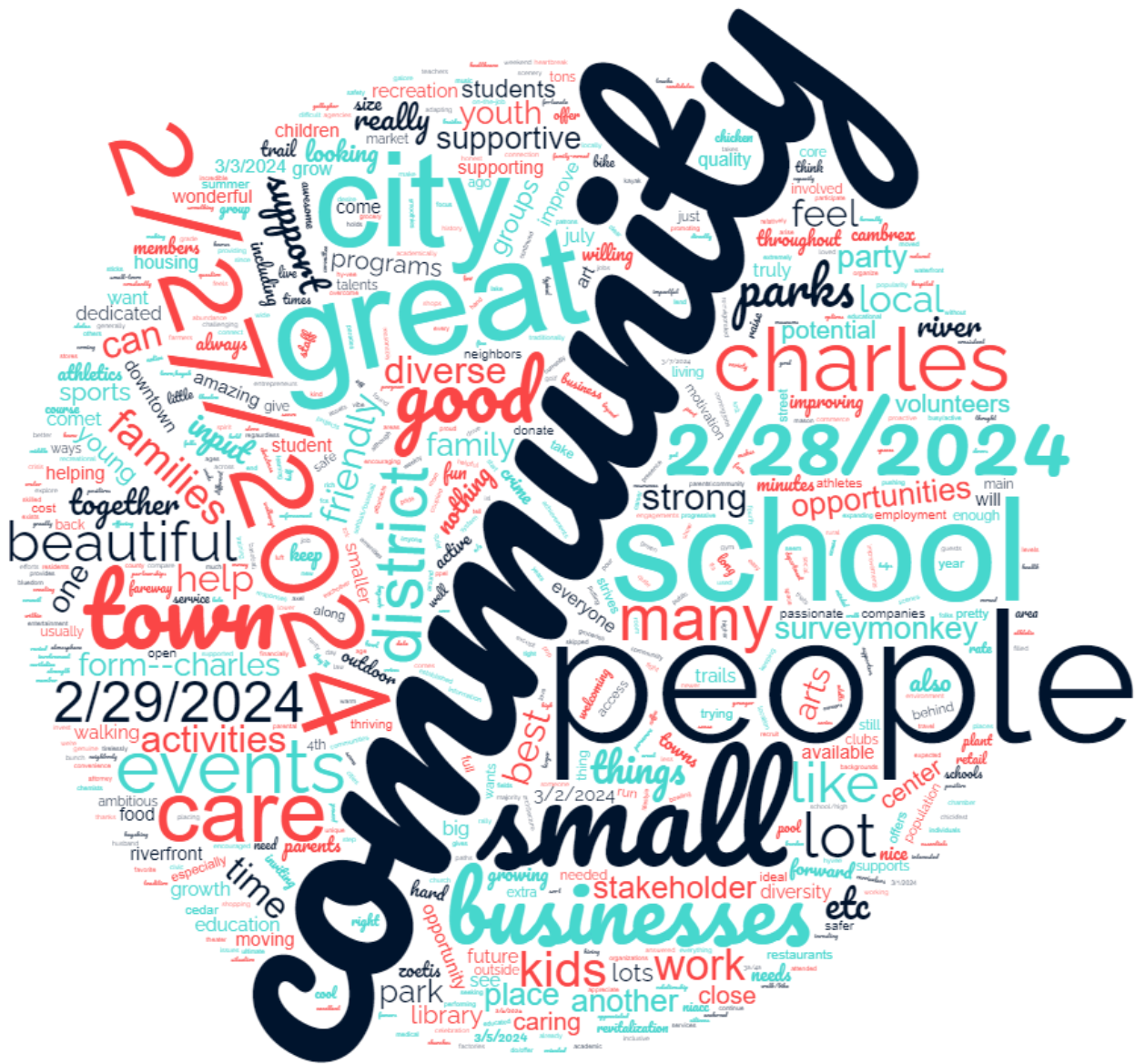
Question 1 Word Cloud